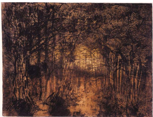
Betye Saar, Lo, The Pensive Peninsula, 1961 21 1/2" x 27 1/2," Sepia etching.