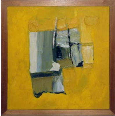
Robert Irwin, Lucky U