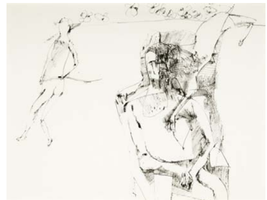
John Altoon, Untitled , 1961 30" x 40," India ink. Museum Associates Purchase with Funds from the Junior Art Council. Los Angeles County Museum of Art, Los Angeles, California, USA. © Estate of John Altoon.