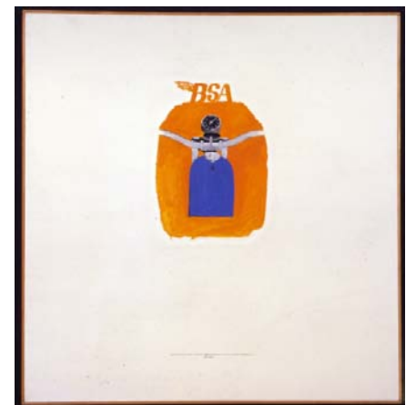
Billy Al Bengston, Gas Tank and Tachometer 2 , 1961 42" x 40," Oil on canvas. Collection of Ed Ruscha. © Billy Al Bengston.