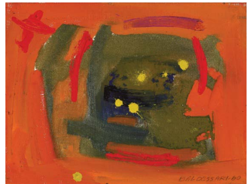
John Baldessari, Micropainting , 1960

20" x 22," Oil on canvas. Orange County Museum of Art, Newport Beach, CA. Museum Purchase with additional funds provided by the National Endowment for the Arts, A Federal Agency. © Ed Ruscha.