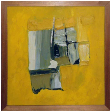
Robert Irwin, Lucky U , 1960

12" x 16," Red chalk, charcoal, ink. Courtesy of Denenberg Fine Arts, Inc., West Hollywood, CA. © Estate of Howard Warshaw.