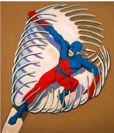
Mel Ramos, The Atom

Los Angeles, September 19, 2011 – The Natural History Museum of Los Angeles County (NHM) will present Artistic Evolution: Southern California Artists at the Natural History Museum of Los Angeles County, 1945-1963 as its contribution to the major initiative Pacific Standard Time: Art in L.A. 1945 - 1980. On view October 2, 2011 to January 15, 2012, Artistic Evolution is inspired by works that were shown at NHM when it was the Los Angeles County Museum of History, Science, and Art, the first dedicated museum building in Los Angeles.