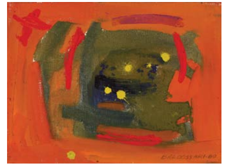
John Baldessari, Micropainting

Artistic Evolution will be on view in the rotunda of NHM’s historic 1913 building, designed by Los Angeles architecture firm Hudson & Munsell. The 1913 building was recently restored and seismically strengthened, revealing exquisite details of the rotunda’s 58-foot dome and 20-foot skylight designed by Walter Horace Judson. The 1913 building is today listed on the National Register of Historic Places.