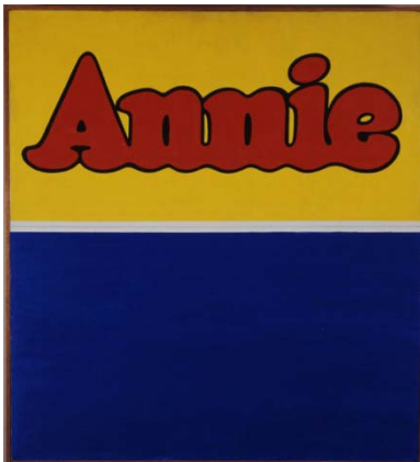
Ed Ruscha, Annie , 1965

42" x 48," Oil on canvas.