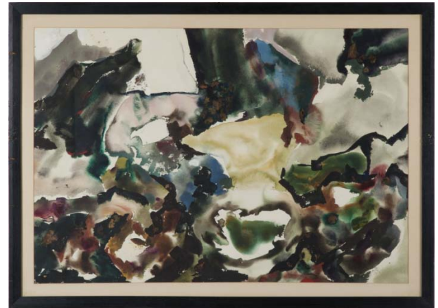
Larry Bell, Rice Tea, Encino, ca. 1958-59 21 1/2" x 31 1/2," Watercolor. Collection of the Artist. © Larry Bell.