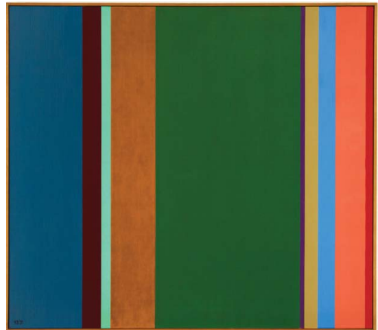
Karl Benjamin, Vertical Stripes #3 , 1959

15 5/8" x 15 3/8," Oil on canvas. Collection Joni and Monte Gordon, Los Angeles. © 2011 Robert Irwin / Artists Rights Society (ARS), New York.