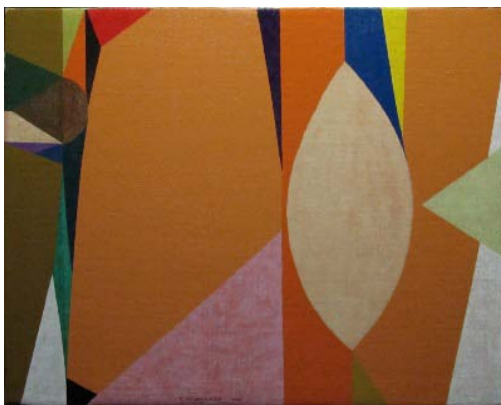
Frederick Hammersley, Untitled Abstract Composition , 1955 24" x 30," Oil on canvas. Collection Louis Stern Fine Arts, West Hollywood, California. © Estate of Frederick Hammersley.